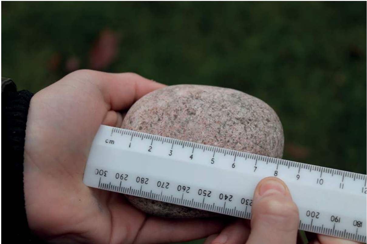
Measuring the pebble